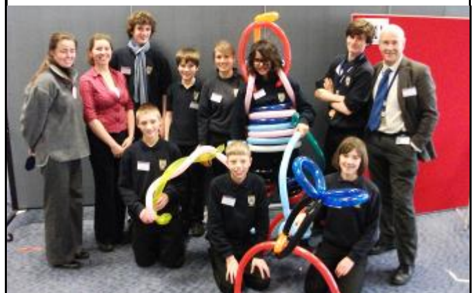
Our Lego League Challenge Team