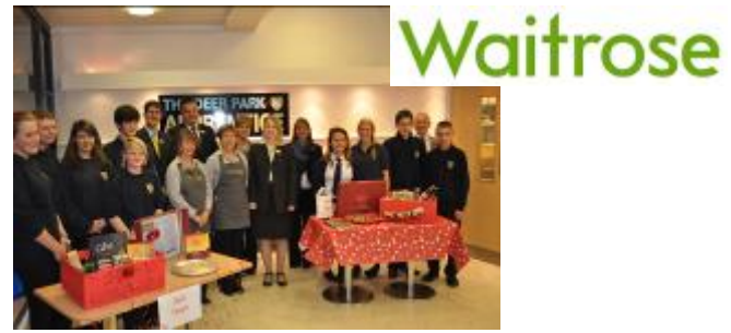
Challenge 2: Marketing with Waitrose